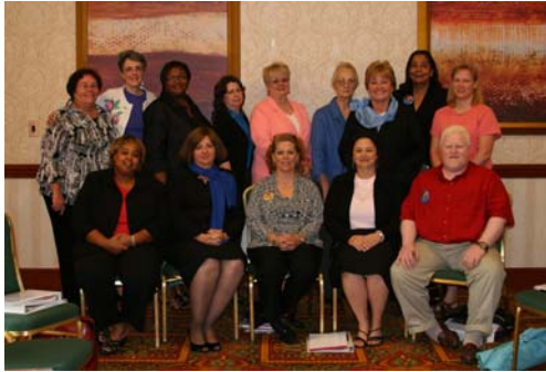
2009-2010 NCD Chapter Presidents