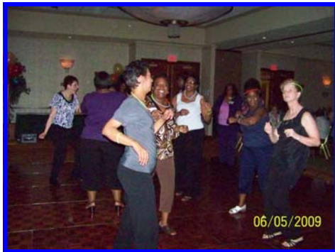
Fun was had by all!!!